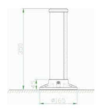
Fig 1.Install on the shoulder and fixed with the expansion screw